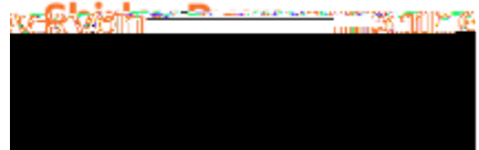
Table 2 shows the overall diversity of the population of the Chicagoland area reflected in IRF